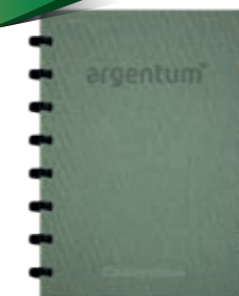
Linen Hardcover A5